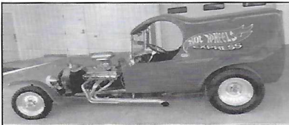
PEOPLES CHOICE WINNER 2016