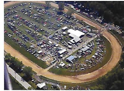
LATIMORE VALLEY FAIRGROUNDS